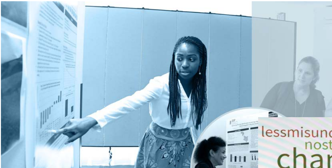
Minority Health and Health Disparities Research Training Fellows: A Poster Session